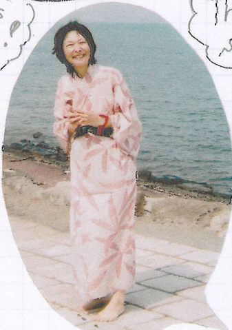
I'm in the sand.