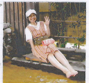
This is a foot bath.

I took a sand bath, a foot bath and a mud bath ☺.